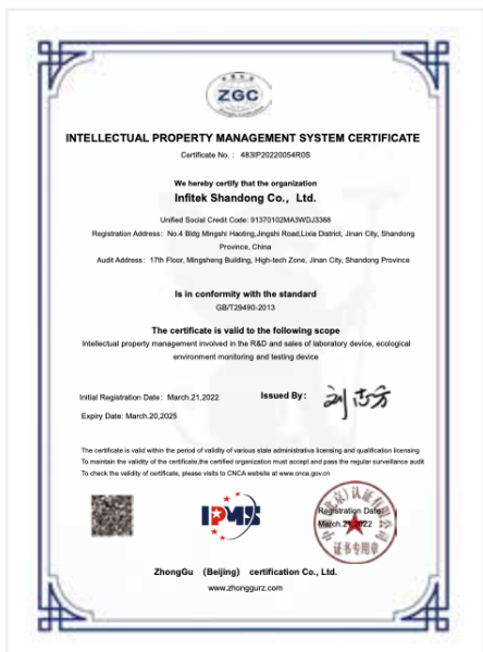
Intellectual Property Management System Certificate