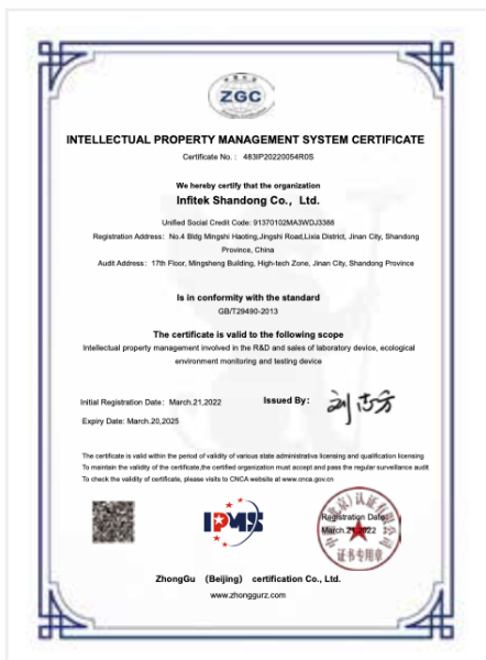
Intellectual Property Management System Certificate