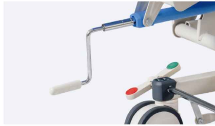
Stainless steel handle with plastic handle, more durable and beautiful