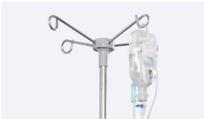
Full SS IV pole, bearing 15kg