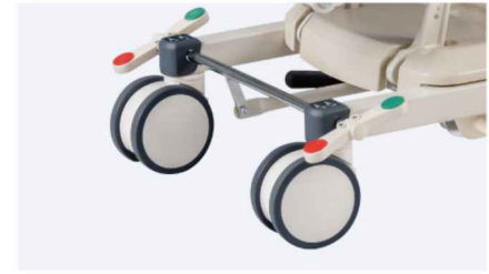
6 inch controlled castors