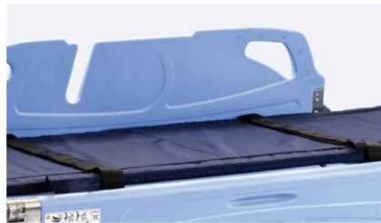
Water proof mattress with 2 belts