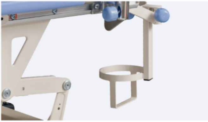
Adjustable vertical oxygen bottle, load capacity: 15KG

LEADING BRAND OF CHINA MEDICAL FURNITURE