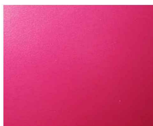
Rose red 2201-30