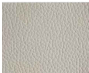
Off white 5509-1