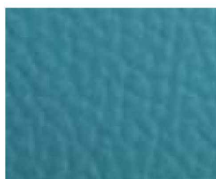
Lake blue 5509-27