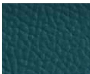
Dark lake blue 2201-40