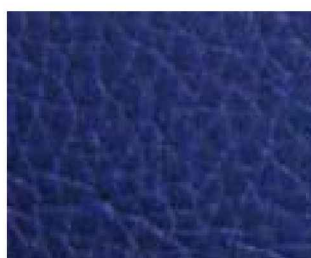
Navy blue 2201-42