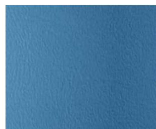
Light blue 5510-43