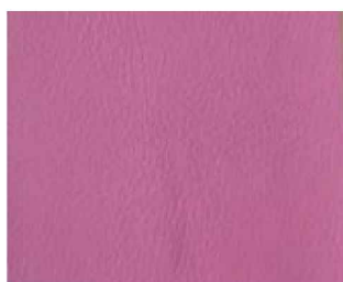
Light rose red 2892-15