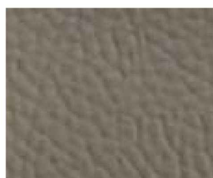
Light grey 5509-14