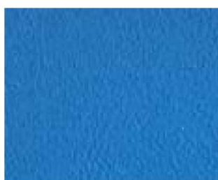
Sky blue 5510-7