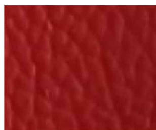
Wine red 2209-22