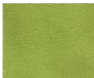
Light green 2210-88