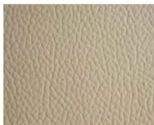
Off white 5509-2