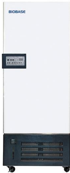
BJPX-A250/II BJPX-A300/II BJPX-A400/II