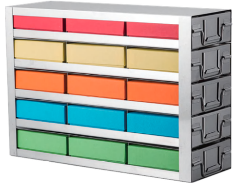
Drawer Type:5 Layers and 3 Columns ( ZKL304-532B-CT )