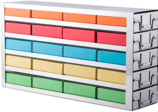
Drawer Type:5 Layers and 4 Columns ( ZKL304-542B-CT )

We will recommend the perfect frozen layer rack matching scheme to improve freezer space utilization and satisfy storage requirements of biobanks.