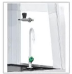
Water & Gas Tap Water Sink