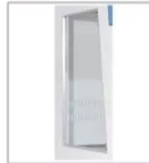
Observation Window Transparent side glass windows maximize light and visibility inside the cabinet.