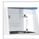
Back Side Air Compensation To avoid turbulence in work area