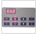
LED Display Digital LED display: Airflow Level