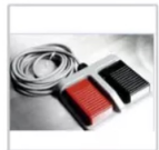
Foot Switch Use foot switch to adjust the height of front window.