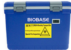
BTB-L12 BTB-L15 BTB-L33