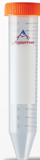
15 ML 17000 g