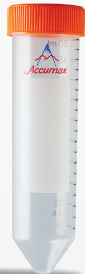
50 ML 20000 g