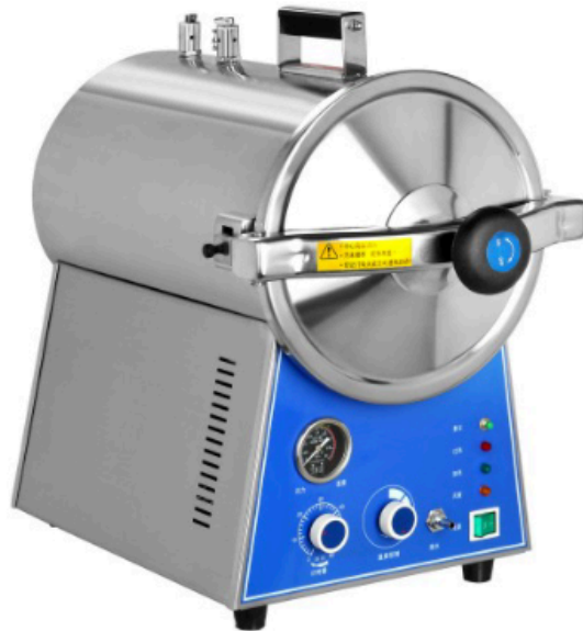
Table Top Steam Sterilizer