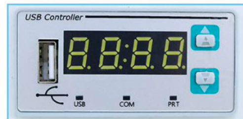
USB Port (Optional)